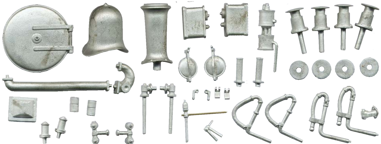
Cast Loco Fittings

So print out a copy of this pdf and check by measuring with a rule that the graduated scale measures 10cm (100mm). This will then confirm that your printer is reproducing to scale and you can compare the castings to the drawing of your intended project.